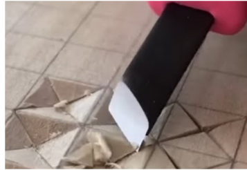
Learning the Bible